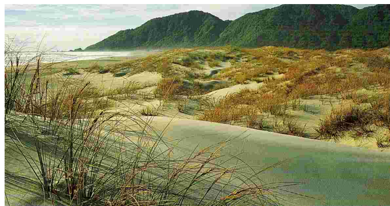
Pingao colonies are most vigorous on mobile sand dunes.

In a review of the ecology and role of marram grass in New Zealand, Gadgil (2006) summaries various studies comparing marram grass with the native sand binders pingao and spinifex including tolerance of salt water, influence on dune shape, wind effects and sand trapping, and competitive effects. In a study of dunes on the Manawatu coast, Esler (1978) found that pingao was associated with lower, more gently sloping foredunes than was spinifex or marram grass. The steepest dunes had a marram grass cover. Pingao was less resistant to sand removal than the other sand binders, and persistent rhizomes of exposed sites were a feature of eroding dunes.