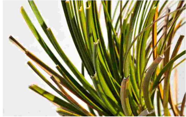
Browsing by rabbits is but one of a range of human-induced factors that has reduced the distribution and frequency of pingao throughout the country.

arenaria ) (Wardle, 1991), recreational and residential development on dunes, sand mining (Partridge, 1992), and harvesting of leaves for weaving. In some districts there is now virtually no pingao on sand dunes.