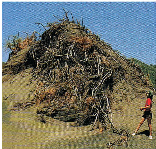
Thick rope-like rhizomes of pingao exposed by wind erosion.

Most plants are borne on long, thick, rope-like rhizomes which run out across the sand surface before become buried by drifting sand. Some southern South Island populations produce dense