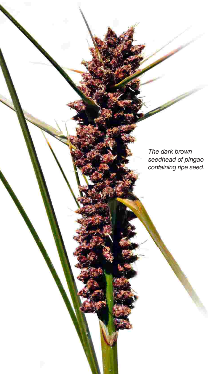
The dark brown seedhead of pingao containing ripe seed.