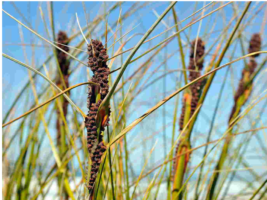
Flowerheads of pingao can be up to 30 cm long. Individual flowers are arranged in a spiral pattern.

Vigorous colonies of pingao usually produce large numbers of seedheads. Seed ripens from December to February depending on location – maturity is reached later in more southern cooler latitudes.