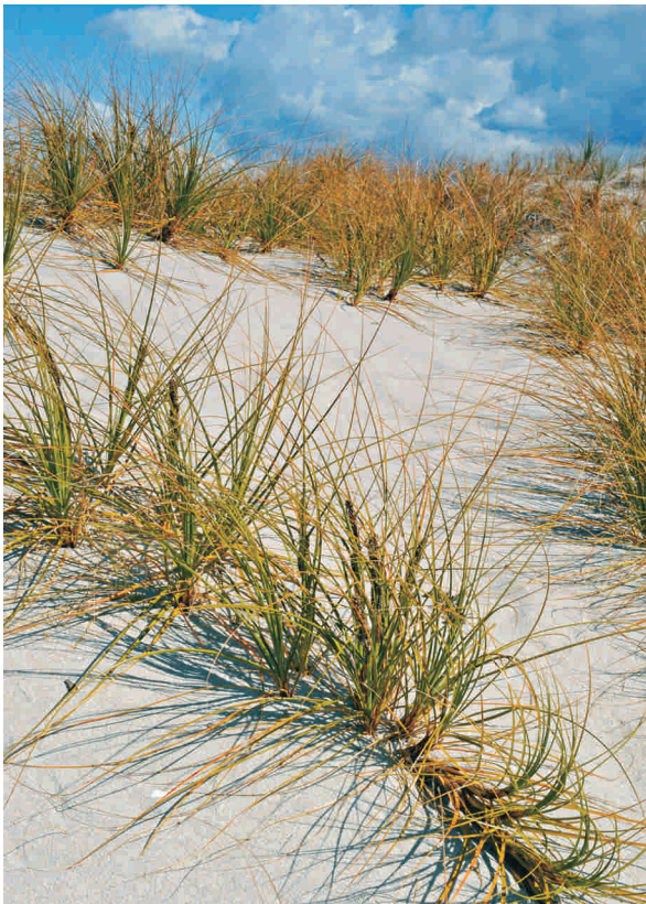
The typical open habitat of a pingao-dominated foredune where the open foliage allows continual sand movement amongst plants.

Vigorous stands of pingao are found only where there is sand movement, typically on the seaward face of coastal foredunes and sometimes extending to active rear dunes. Wind-blown sand is readily trapped around its stems and leaves and hence it is very effective in contributing to dune building. Pingao only partially traps sand as a result of the density of its foliage and the plants morphology creating active sand dunes which allows a degree of sand movement.