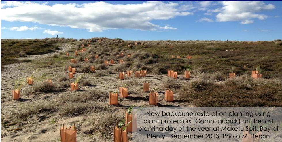
New backdune restoration planting using plant protectors (Combi-guards) on the last planting day of the year at Maketu Spit, Bay of Plenty. September 2013.