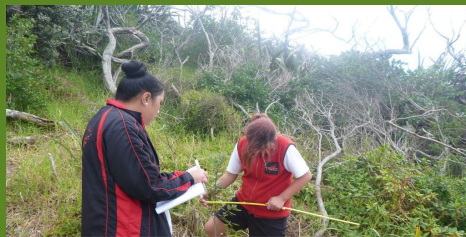
Children from Te Kao School helping with the measurement of planted natives on backdunes at Rarawa Beach, Far North, Northland.