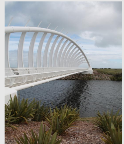
Popular bridge near the Taranaki Living Legends coastal planting at Te Rewarewa Reserve, New Plymouth.

Go to www.dunestrust.org.nz for conference updates and registration forms. Registrations are due to open in November.