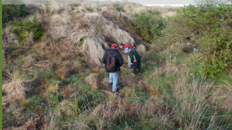
A survival count of planted natives underway by the Waitohu Care Group, Kapihi Coast.