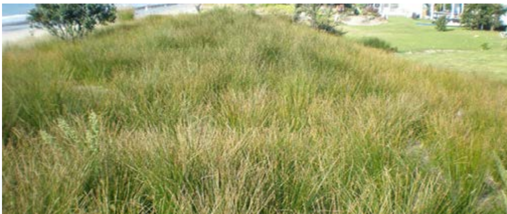
Figure 2: Restoration at first Cooks Beach backdune trial site - showing dune dominated by exotics (top), following excavation and planting (middle) and dense native backdune vegetation 1 year after planting (bottom). Each backdune trial was undertaken the year following restoration of the spinifex zone to seaward (e.g. the works shown in Figure 1).