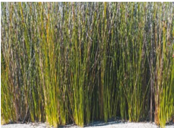
Knobby club rush

Before and after shots of the first backdune restoration are shown in Figure 2. The restoration work was extremely successful in restoring dense native backdune vegetation – with complete vegetation cover largely achieved within one year.