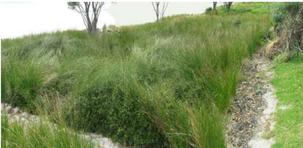
Figure 3: Whangapoua trial area 1 - before clearance (top), 1 month after planting (middle) and 15 months after planting (bottom).