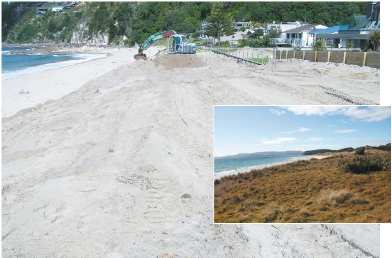
The 'whole of dune' approach involves mechanically removing the dense weedy layer from the dune (inset) to leave clean loose sand to allow planting of native sand binders on the foredune zone and native backdune species on the landward zone.