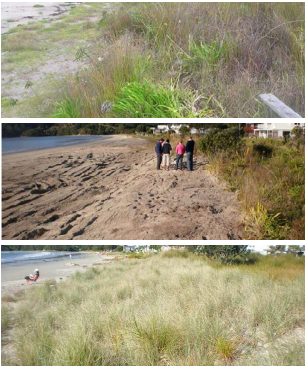
Figure 1: Restoration of sand binder zone at first Cooks Beach trial site - showing exotic dominated dune before works (top), following excavation and prior to planting (middle) and 1 year after planting (bottom). A two-stage 'whole of dune' restoration process was used to reduce risk of wind-blown sand – the foredunes were restored first to a cover of native sand binders before the landward backdune zone was restored the following year.

Restoration of the sand binder zone used a similar approach to the backdune trials. Typical 'before' and 'after' photographs of this work are shown in Figure 1. This work was very successful – typical of similar work at many other sites over the last 20 years.