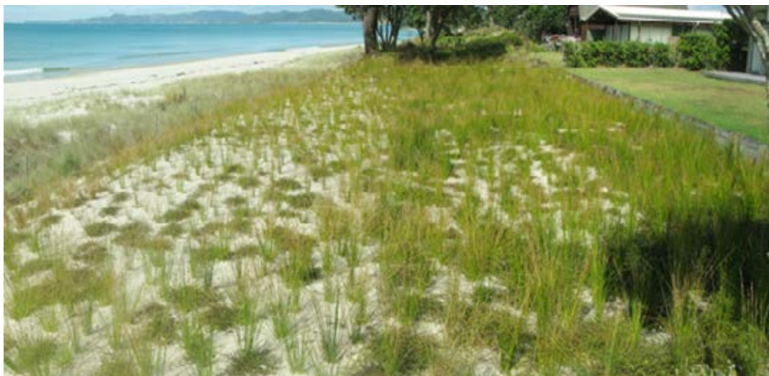
Figure 4: View of second trial site - prior to restoration (top photo), immediately after planting in August 2013 (middle) and in April 2014 about 9 months after planting (bottom).