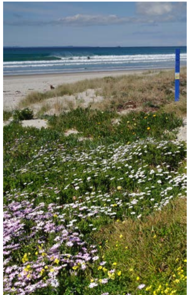
Re-invasion of restored foredunes by aggressive weed species spreading from backdunes can occur over time (above) if backdunes dominated by exotics including garden escapes (below) are not also restored to appropriate native species.

Coast Care programmes typically have limited budgets for each site and so the difficulties with backdune restoration mean groups often focus on other areas where there are more readily achievable gains. More successful and sustainable approaches are required to facilitate long term dune restoration at degraded urban sites.