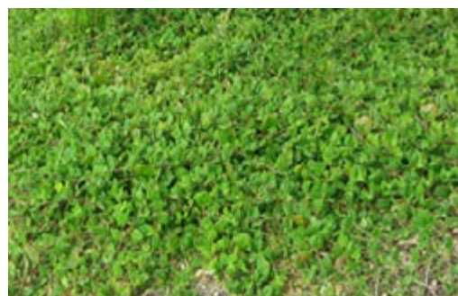
Species 12 months after inter-planting with pohuehue and knobby club rush. These include sand tussock (top left), sand coprosma (top right), sand daphne (middle left), Carex testacea (middle right), NZ spinach intermingled with knobby club rush (bottom left) and NZ spinach as the sole cover in a shady area (bottom right).