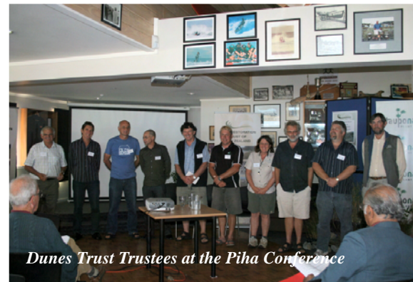
Dunes Trust Trustees at the Piha Conference