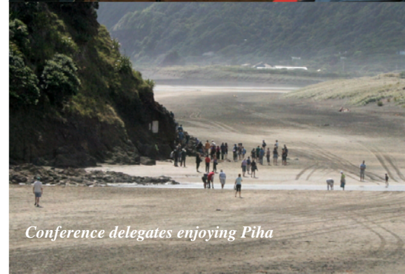
Conference delegates enjoying Piha