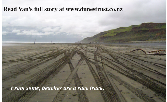
From some, beaches are a race track.

Read Van's full story at www.dunestrust.co.nz