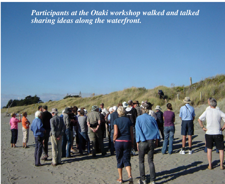
Participants at the Otaki workshop walked and talked sharing ideas along the waterfront.