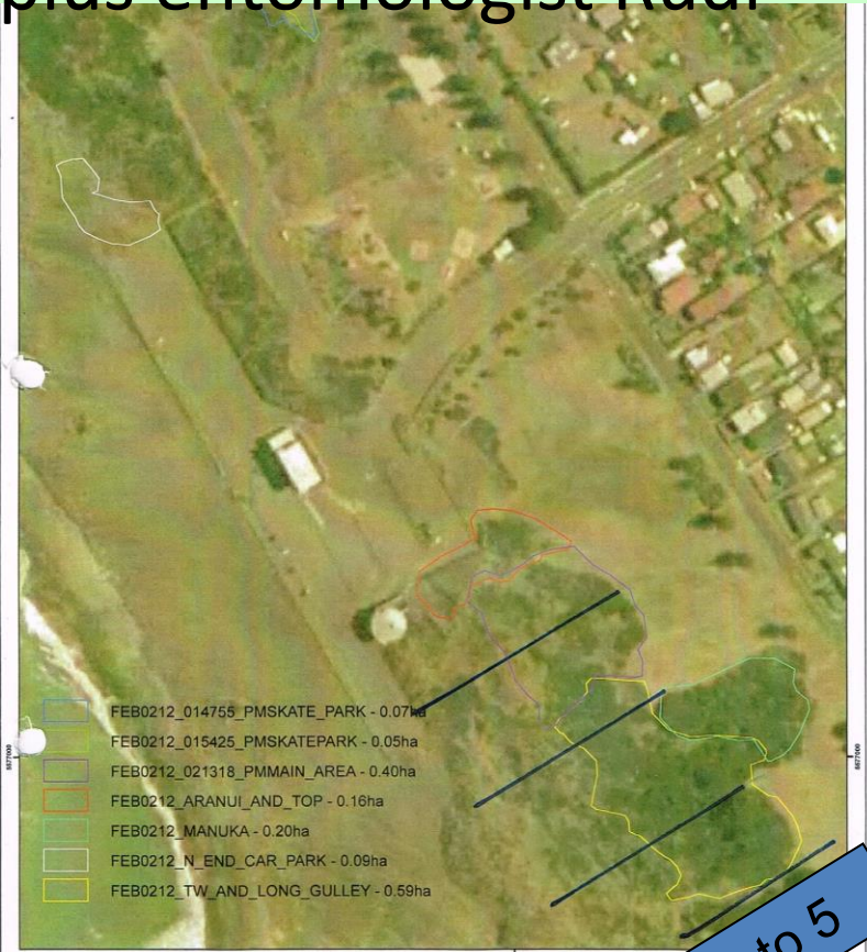
Department of Conservation Te Papa Ataturu Castlecliff Planting Areas February 2012 0 10 20 40 60 80 Metres Te Papa Ataturu Department of Conservation

Four transect lines (50 m apart, marked on the dunes) with 5 sampling points on each.