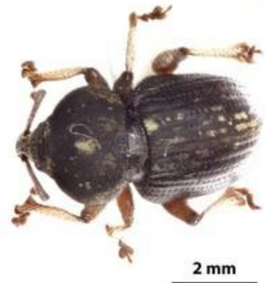
Interesting native & introduced fauna & flora