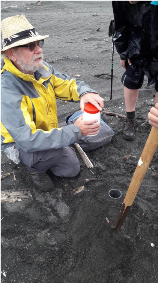
On the beach