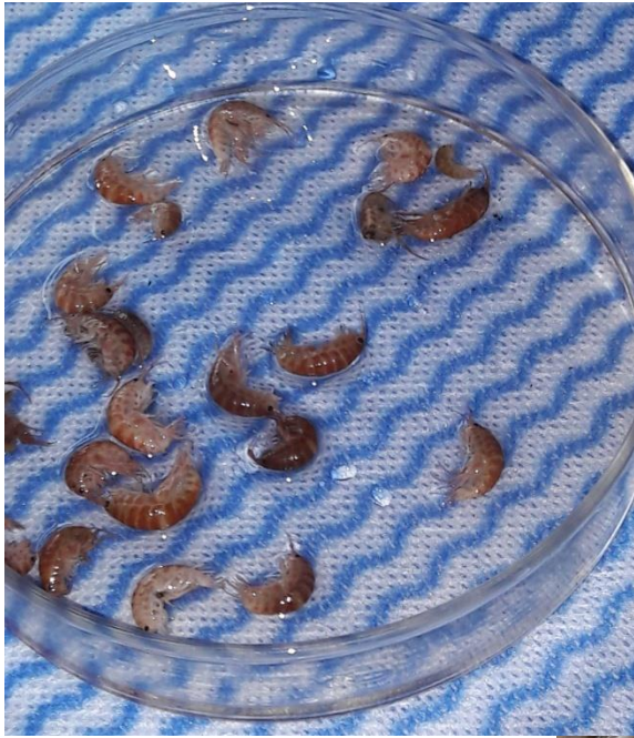
Sand hoppers (from the beach)