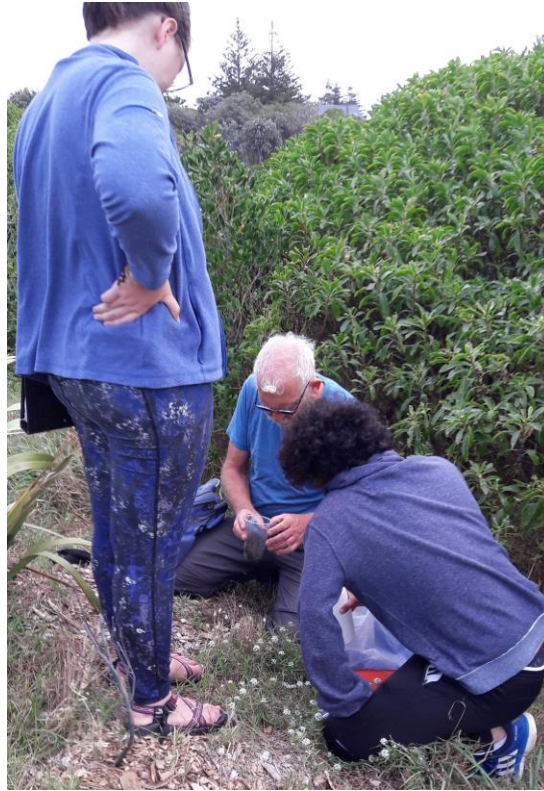
& in the bushes