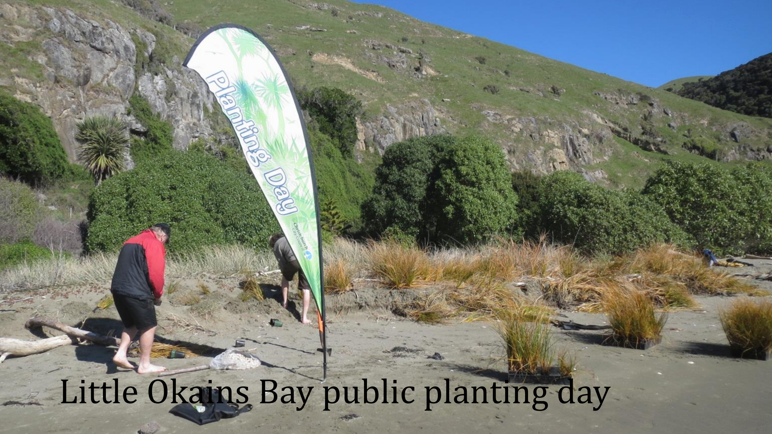
Little Okains Bay public planting day