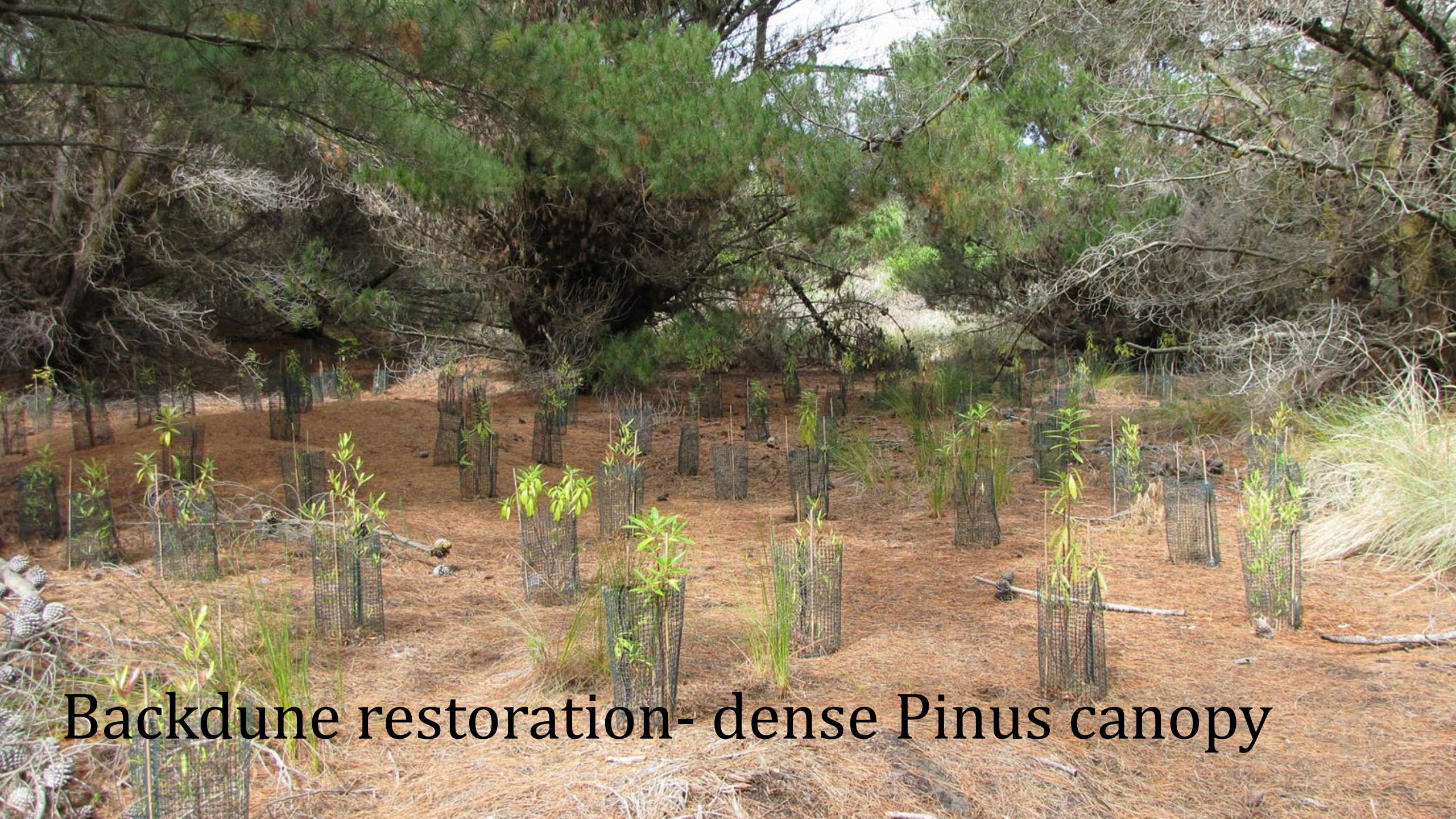
Backdune restoration- dense Pinus canopy