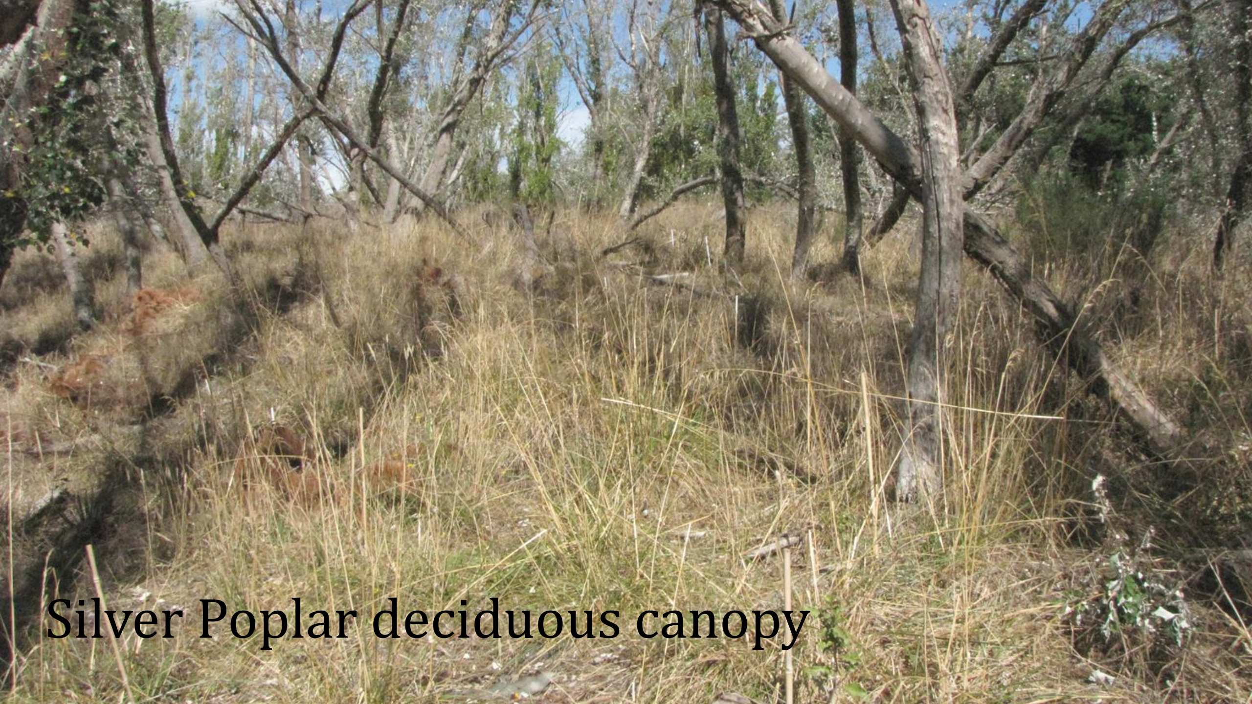
Silver Poplar deciduous canopy