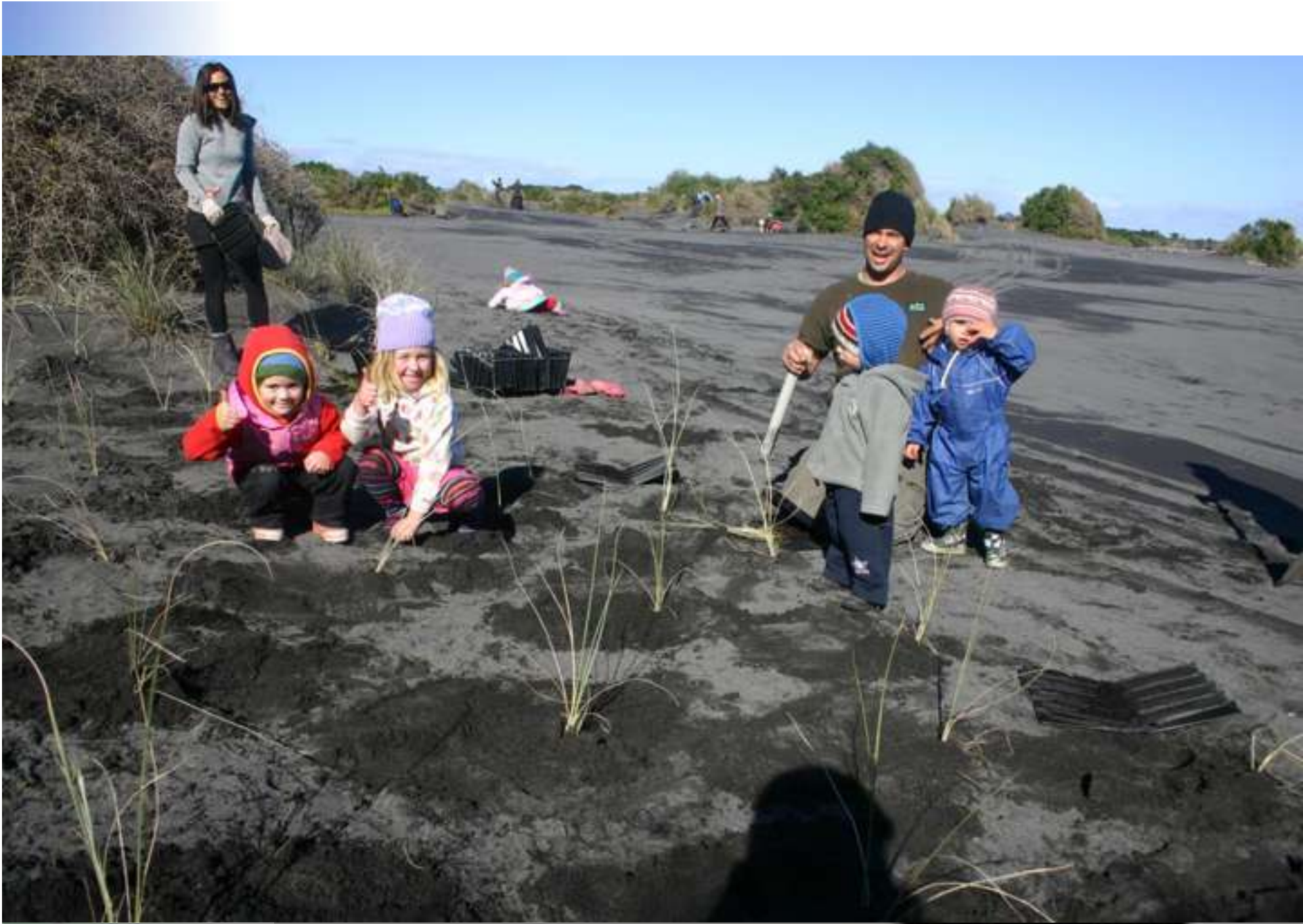
Working with people | caring for Taranaki