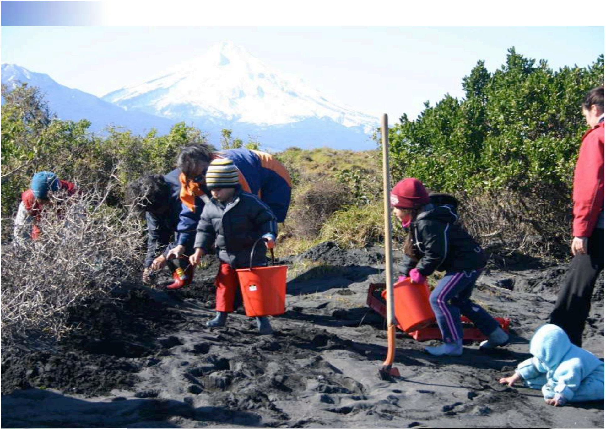
Working with people | caring for Taranaki