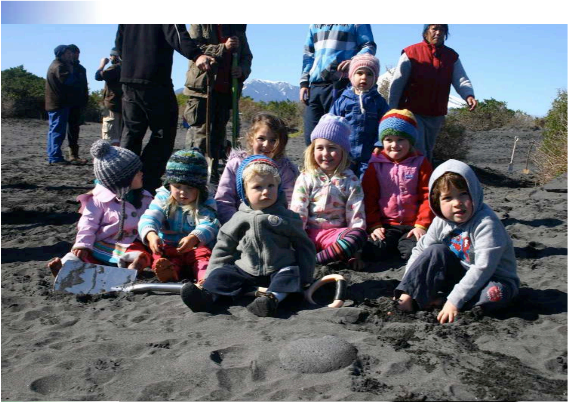
Working with people | caring for Taranaki