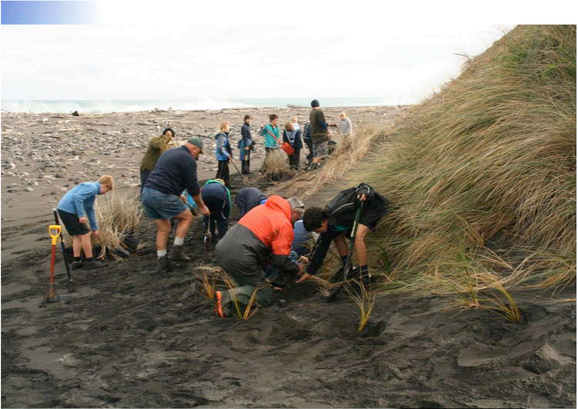
Working with people | caring for Taranaki