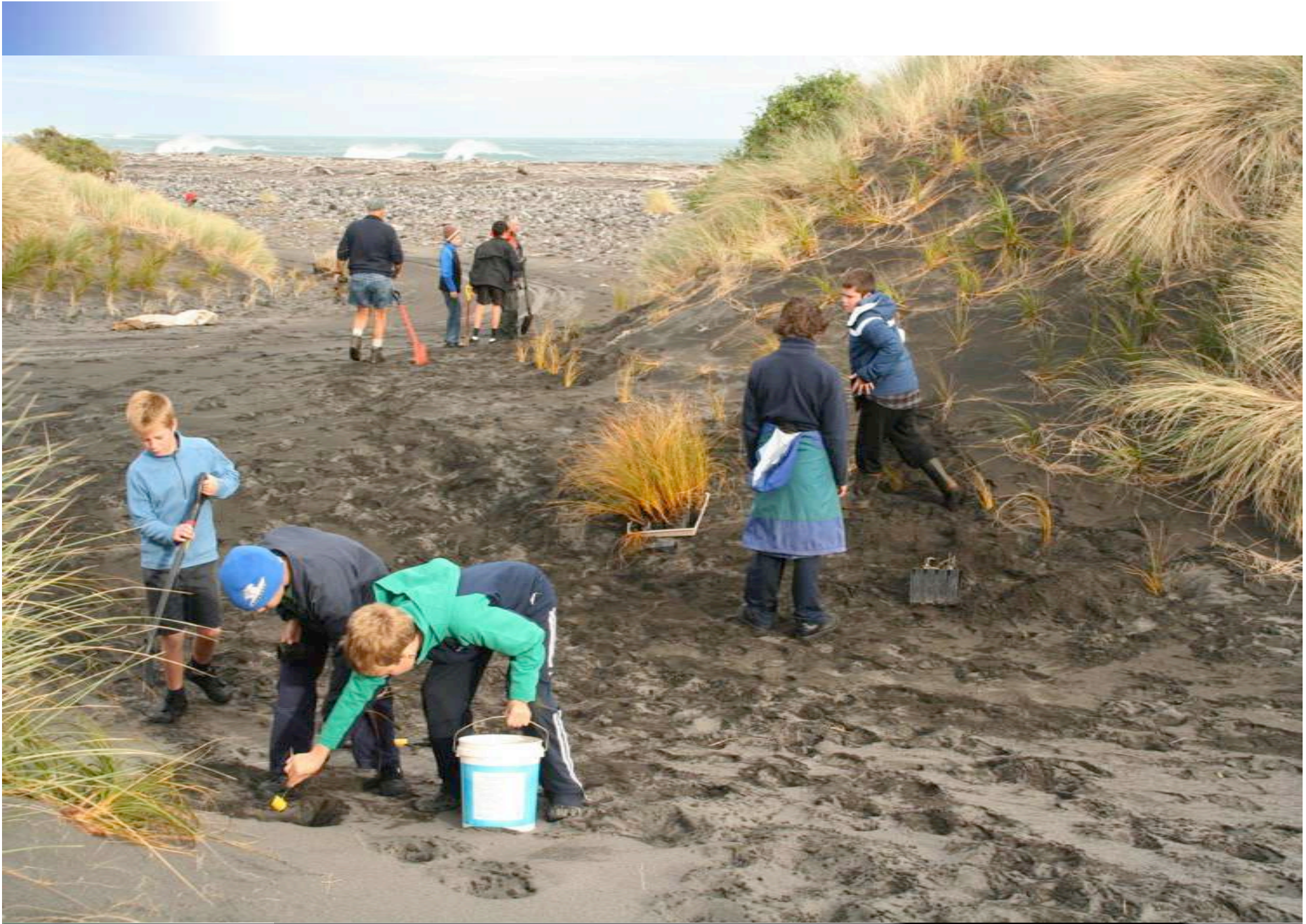
Working with people | caring for Taranaki