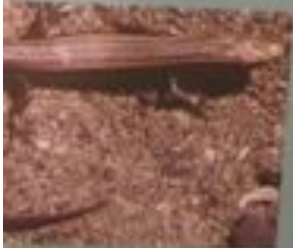
Common skink, Oligoplantare