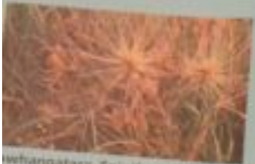
whangatarā, Spinifex, Spinifex acutus This is New Zealand's most dune building & its long runners catch windblown sand build low rolling sand dunes, which can be the damage caused by tsunami, sea level rise & storm surge.