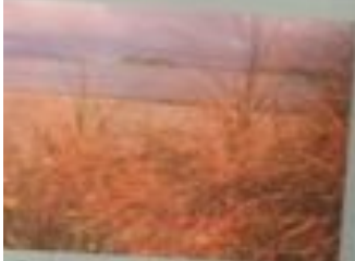
Golden sand sedge, Phoenix spiralis An endemic dune plant, found only on sand. Maori legend tells that Pingao, brother of Tane, the god of the forest, is eyebrows to his jealous brother or god of the sea, as a peace offering.