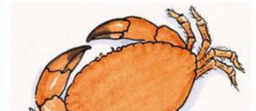
KIDS ACTIVITY PAGES: See our special beachcare activities and games for kids!