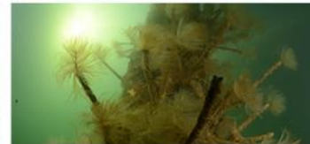
PEST PLANTS: Take a look at some common coastal pest plants and learn about weed control.