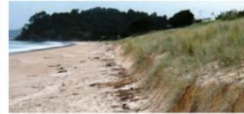
DUNE RESTORATION: Learn more about dune monitoring and best-practice for restoration.