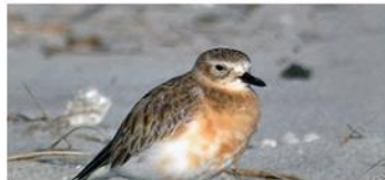
ANIMAL BIODIVERSITY: Learn more about the biodiversity hiding on our beaches!