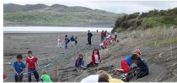
BEACHCARE GROUPS: Take a look at community-lead action throughout the region.