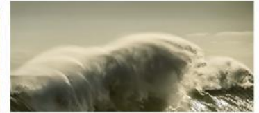
COASTAL PROCESSES AND WEATHER HAZARDS: Learn more about dune erosion.