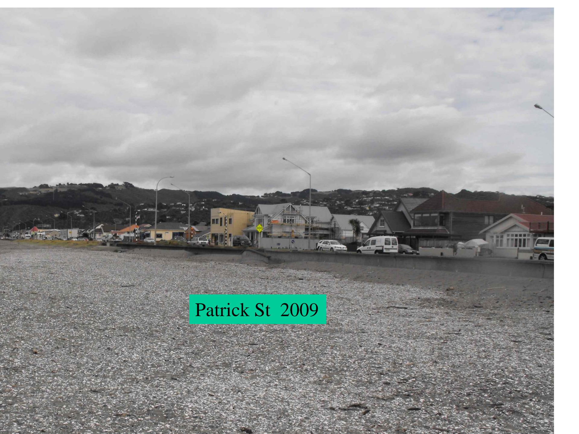
Patrick St 2009