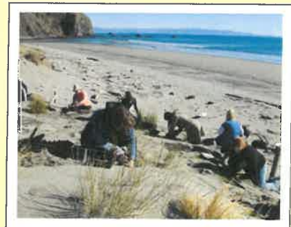
Pacific Discovery volunteers planting at Kokorua

For more information about the event please contact Kirsten Crawford on 027 278 5646 or at info@dunestrust.org.nz