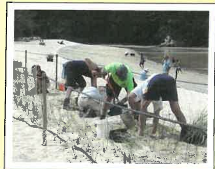
Restoring the sandspit at Torrent Bay

Plus an optional two-day post-conference trip (8 & 9 March) around Golden Bay's beaches and along Farewell Spit.