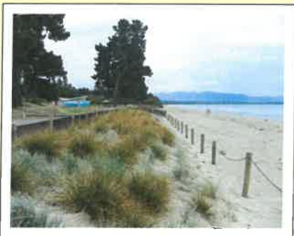
Pingao and spinifex at Rabbit Island

This year's highlights include three field trips, to Nelson's Tahuna beach, Rabbit Island beach and the golden sand beaches around Kaiteriteri.