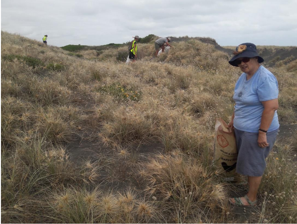
Above - Spinifex collection Right - stripping Pingao seeds